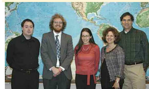
(top left) Participants in the 2007 Summer Institute for Global Justice stand in front of the Peace Palace in The Hague after meetings with Judge Thomas Buergenthal of the International Court of Justice and representatives of the Permanent Court of Arbitration.