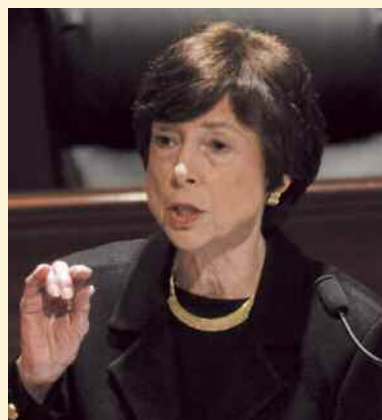
Carla A. Hills Former United States Trade Representative