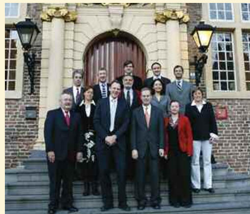
Utrecht summit participants outside the Utrecht University Faculty Club during a break between meetings