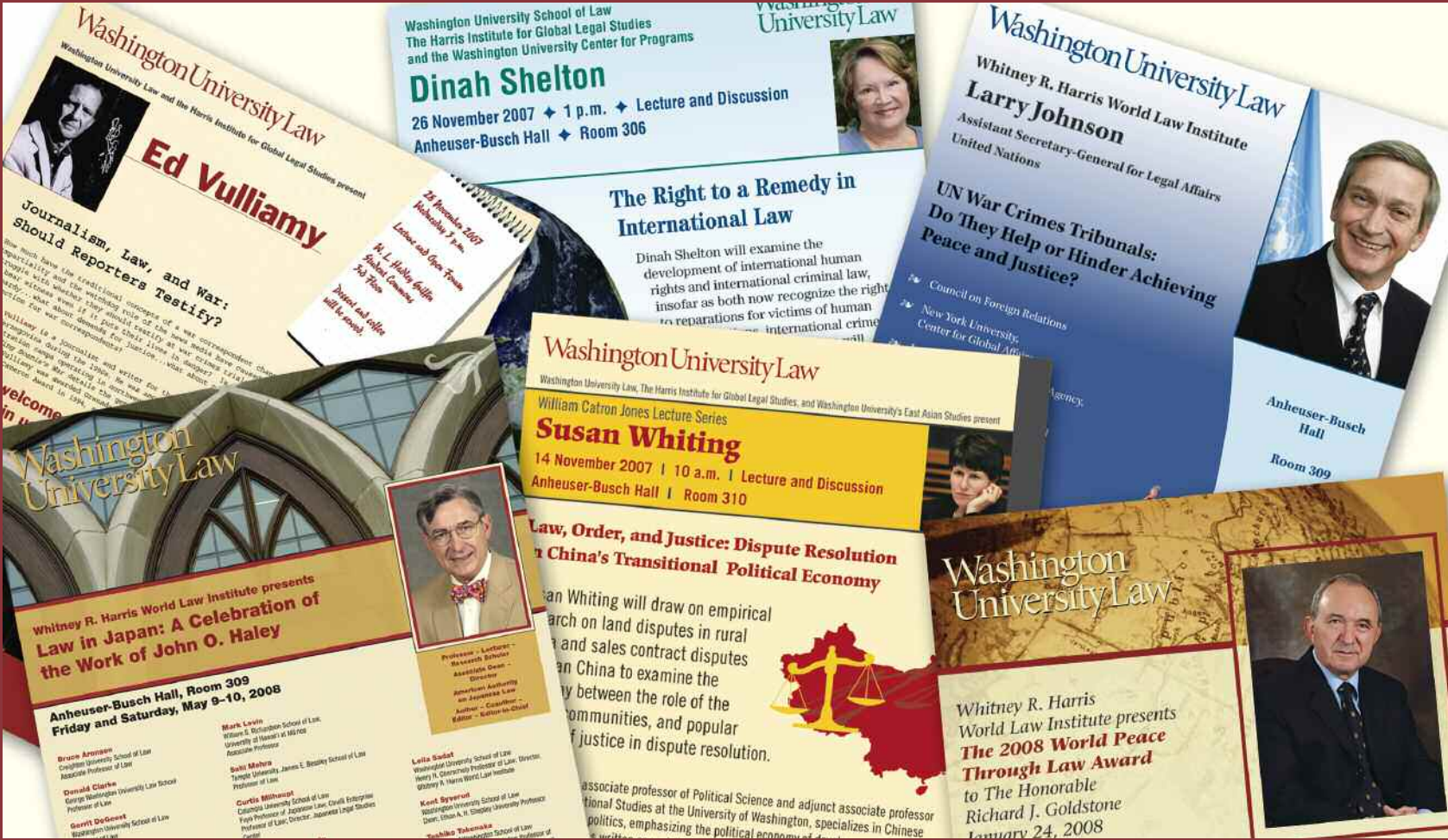
This poster collage represents some of the lectures and events sponsored by Washington University Law's Whitney R. Harris World Law Institute in 2007-08.