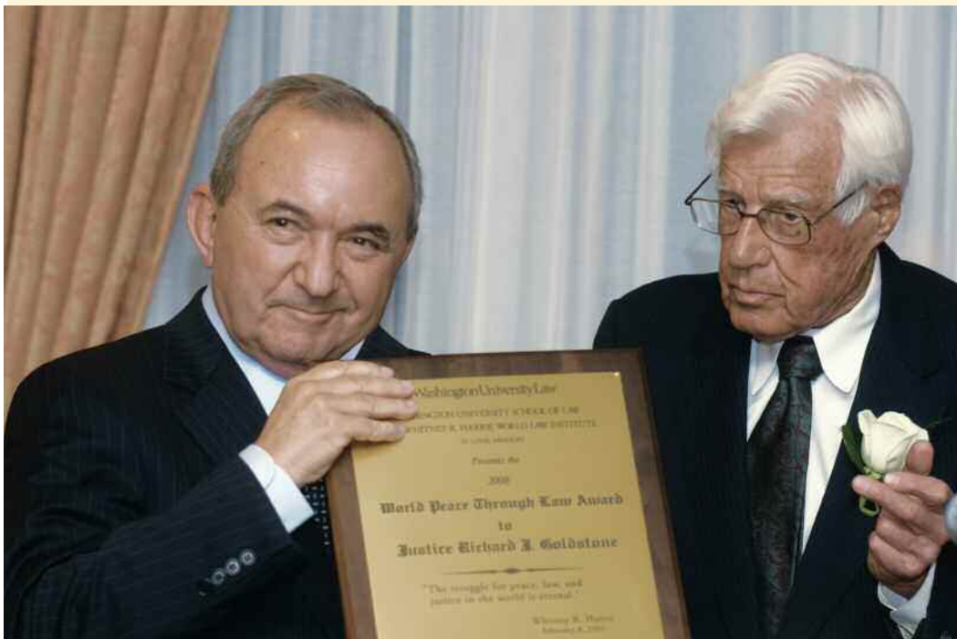
2008 World Peace Through Law Award recipient Richard J. Goldstone, left, and Whitney R. Harris with the plaque commemorating the 2008 World Peace Through Law Award

Richard J. Goldstone, former chief prosecutor of the International Criminal Tribunals for the Former Yugoslavia and Rwanda and former justice of the South African Constitutional Court, received the Whitney R. Harris World Law Institute's 2008 World Peace Through Law Award at a celebration in January 2008.