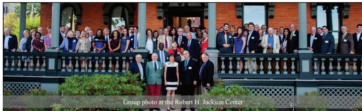
Group photo at the Robert H. Jackson Center

Interactive porch sessions spanned a range of topics from non-State Actors and IHL, to Islamic Extremism, Cyber Warfare and LOAC. For more information, visit the IHL Dialogs website.