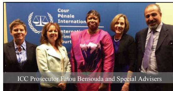
ICC Prosecutor Fatou Bensouda and Special Advisers

The later event was a triple book launch and included remarks from 16