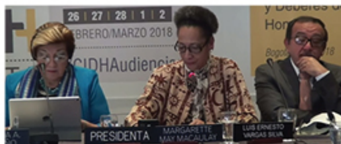
Members of the Inter-American Commission on Human Rights

During the joint recommendations at the end of the hearing, the Harris Institute urged the Commission to conduct a study on gun violence in the United States, with a special focus on school shootings, and hold a thematic hearing on this important issue.