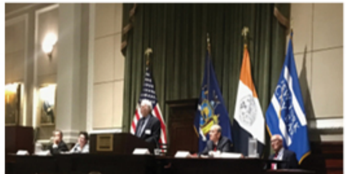
Opening Plenary Session for International Law Weekend in New York