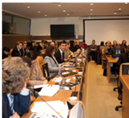
Participants at the ICC ASP Side Event on Crimes Against Humanity