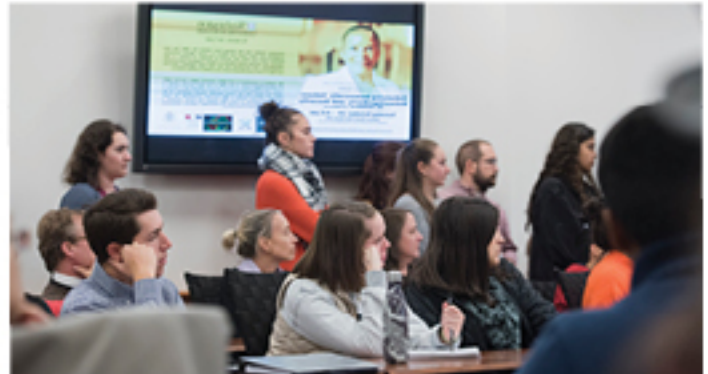
Members of Washington University and the larger St. Louis Community listening to former French Minister of Justice Mme. Christiane Taubira

In Fall 2017, Former French Minister of Justice Mme. Christiane Taubira lectured on Enhancing Democratic Values: Balancing Liberty and Security in Modern France and met with members of the wider St. Louis community. The well-attended lecture generated interesting and thoughtful questions from the audience.