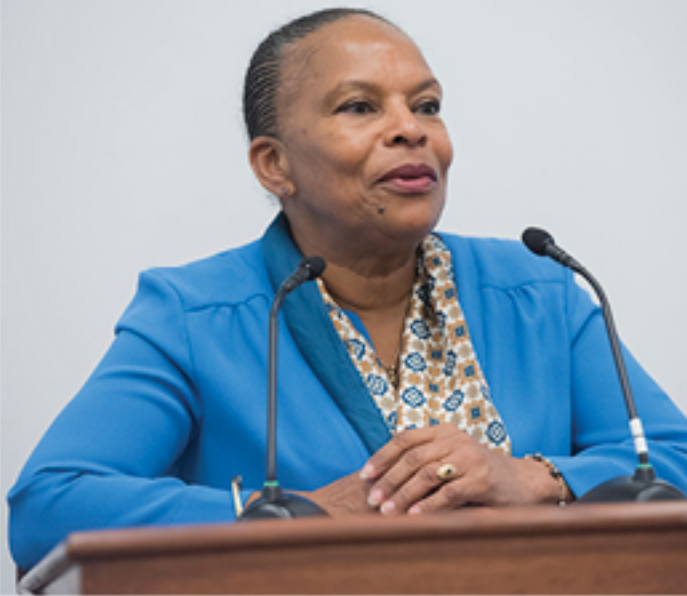
Mme. Christiane Taubira

In Fall 2017, Former French Minister of Justice Mme. Christiane Taubira lectured on Enhancing Democratic Values: Balancing Liberty and Security in Modern France and met with members of the wider St. Louis community. The well-attended lecture generated interesting and thoughtful questions from the audience.