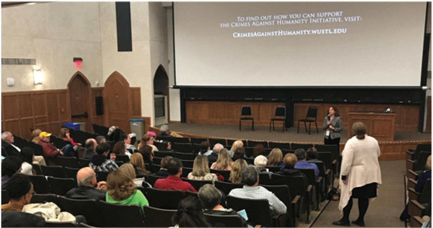
Professor Leila Sadat leads a post-screening Q&A at the 2017 St. Louis International Film Festival

In Summer 2017, the Harris Institute launched the documentary film Never Again: Forging a Convention for Crimes Against Humanity to support efforts to create a new global convention on crimes against humanity. Never Again features moving testimony from survivors of atrocity crimes, as well as calls from international experts, and highlights that peace is not possible without justice.