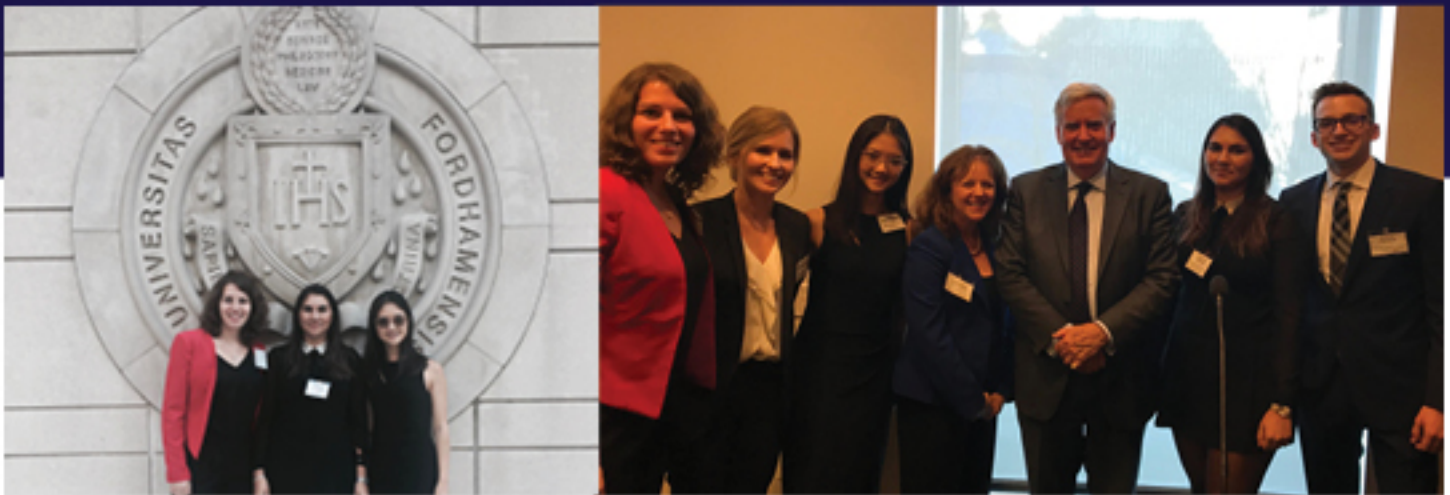
Washington University law students, faculty, and alumni with H.E. Judge Christopher Greenwood of the International Court of Justice